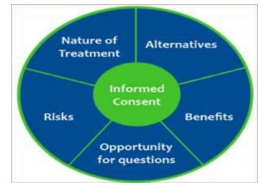
All-Wales Consent to Treatment Group Grŵp Cydsynio i Driniaeth Cymru Gyfan