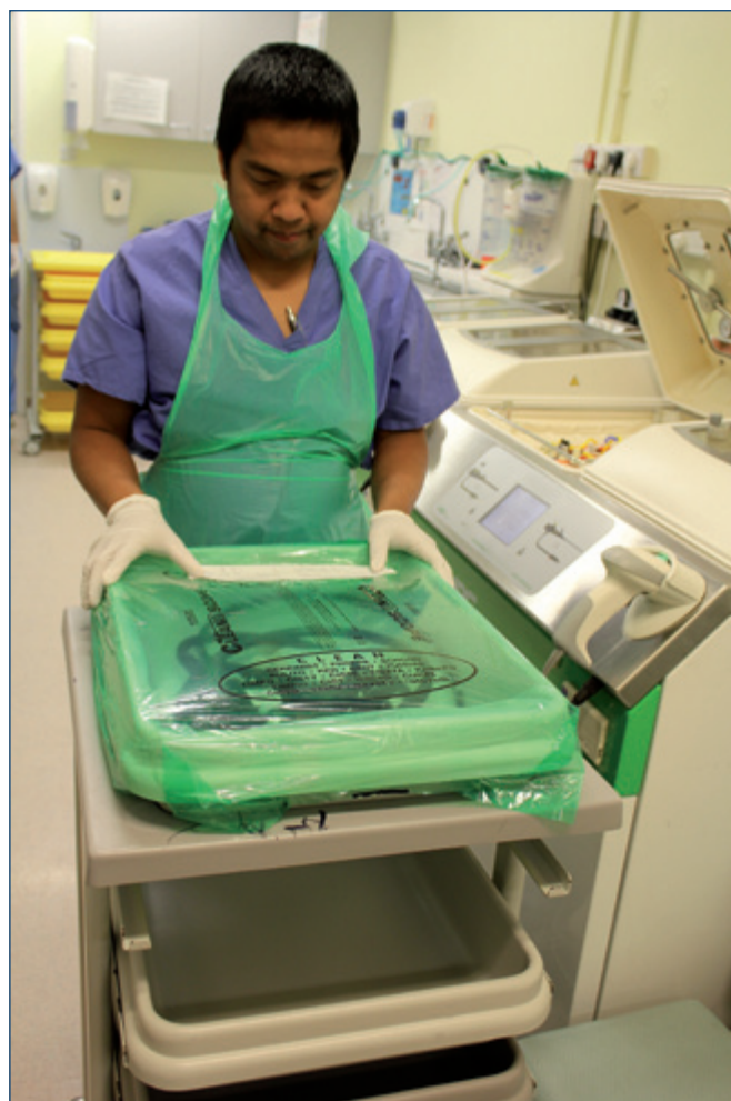
Endoscopy washroom with top-loading AERs