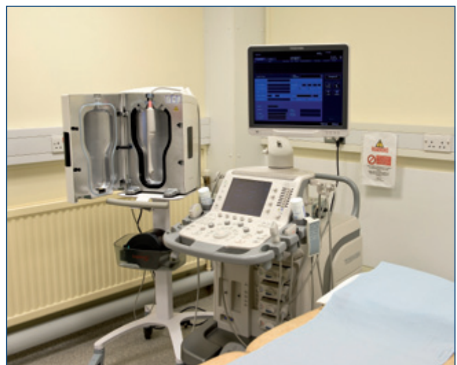
An example of technology designed to provide validated decontamination process of TVUS/TVUR probes

The plugs for the probes are multi-pin and, if removed too many times, it is possible to damage the pins themselves. Therefore it is recommended that the