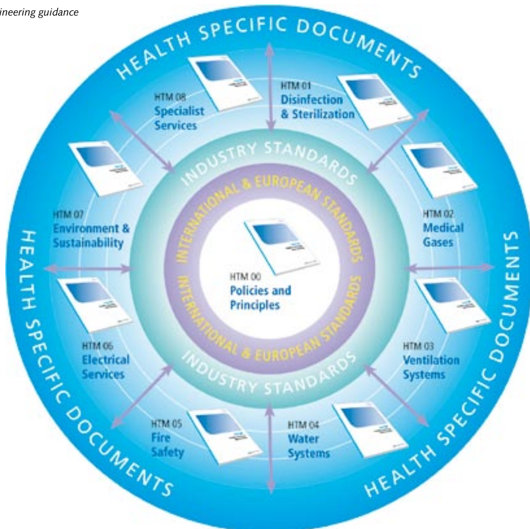
Figure 2 Engineering guidance

In a similar way Health Technical Memorandum 07-02 will simply represent: