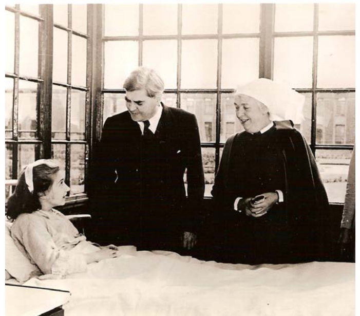
Nye Bevan on the 1st day of the NHS, 5th July 1948, Park Hospital Davyhulme

"All I am doing is extending to the entire population of Britain the benefits we had in Tredegar for a generation or more. We are going to 'Tredegar-ise' you."