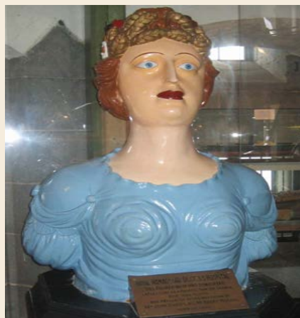
"Hamadryad bowsprit, Pembroke Museum"