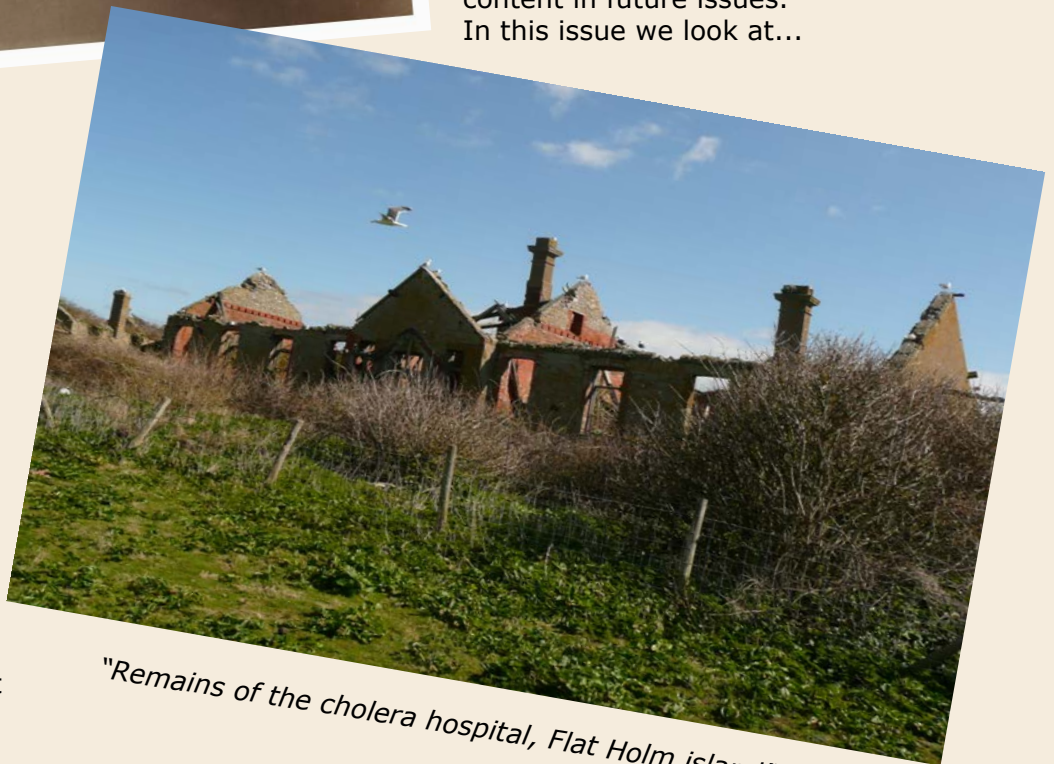
"Remains of the cholera hospital, Flat Holm island"

She was originally moored in East Bute Dock, but was soon relocated to the ominously named Rat Island where she did a roaring trade in helping sick seamen – 400 in her first year and by 1897 more than 10,000 men (and it was only men) were treated each year. Along with a wooden annex built to house further infectious patients in 1871, the Hamadryad served as the only isolation hospital in the area until a dedicated cholera hospital was opened on Flat Holm island in the 1890s.