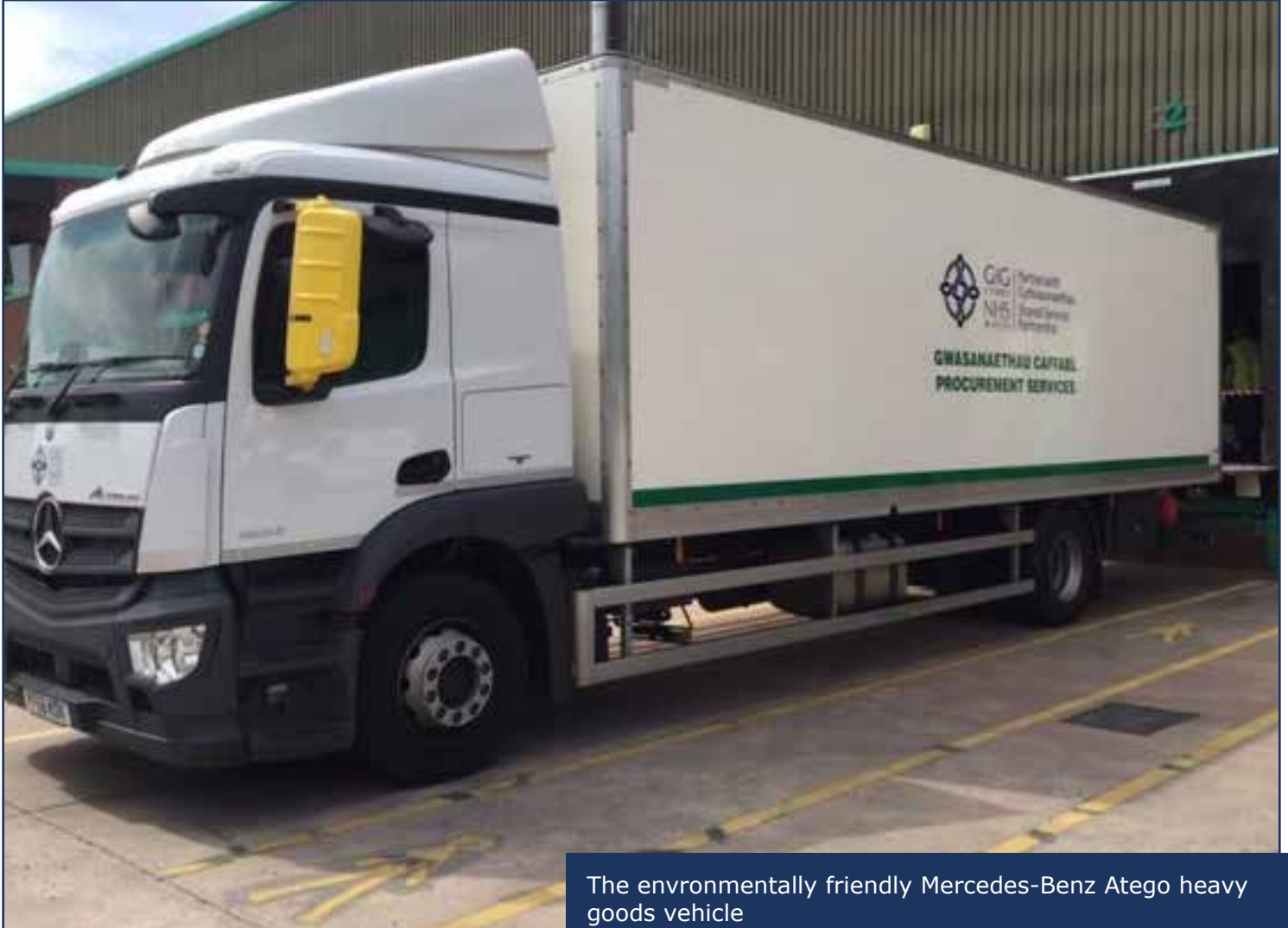
The environmentally friendly Mercedes-Benz Atego heavy goods vehicle

Procurement Services, Supply Chain, is committed to managing their environmental impact, reducing their carbon footprint and increasing their sustainability. As a direct output of a recent review of the Denbigh Regional Stores, North West Wales Daily Transport Schedule an opportunity to reduce the carbon footprint and operational costs was identified.