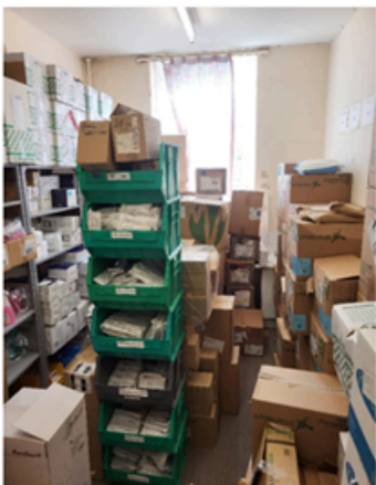
Image below shows unorganised stores pre-implementation

As over ordering occurred, this resulted in an increased health and safety risk around the storage of goods (items on the floor as no racking or in storage solutions) and presented a real risk to staff safety.