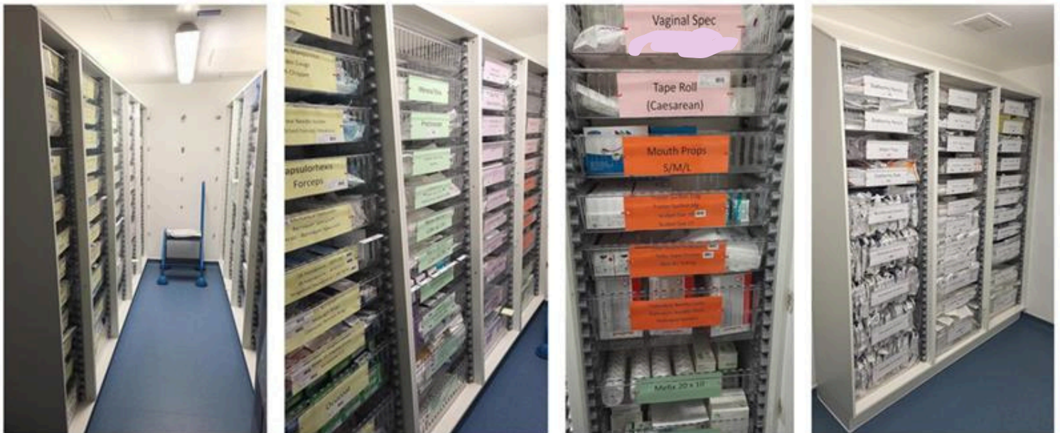
Image below shows improved stores post-implementation