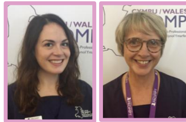
PROMPT Maternity Foundation