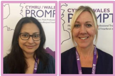
PROMPT Wales National Team

There is a dedicated multi-professional team to help you move forward with delivering PROMPT in your unit! Contact PROMPT Wales to be directed to the team member best placed to help you!